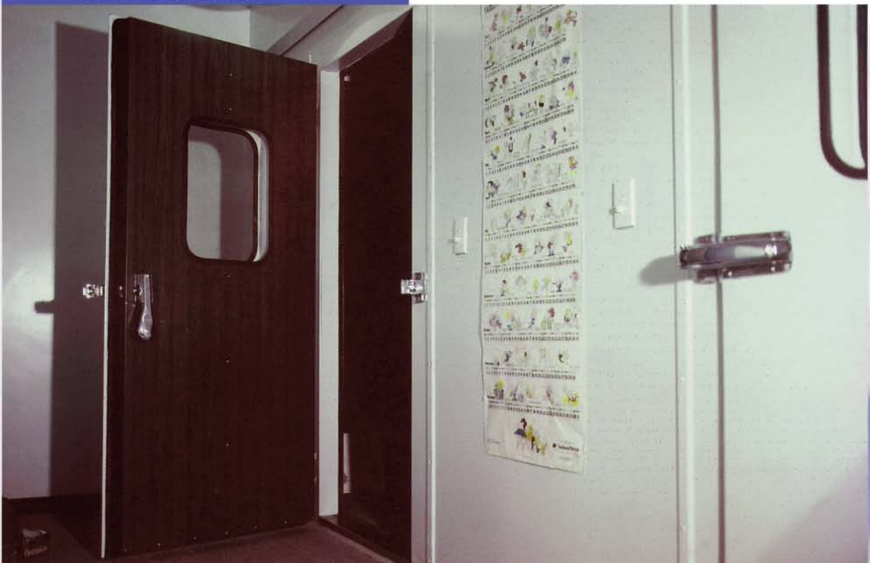
Non-Standard room to clients specifications.

The acoustic performance is detailed opposite and the purchaser should ensure that the space available will not cause any reduction in performance.