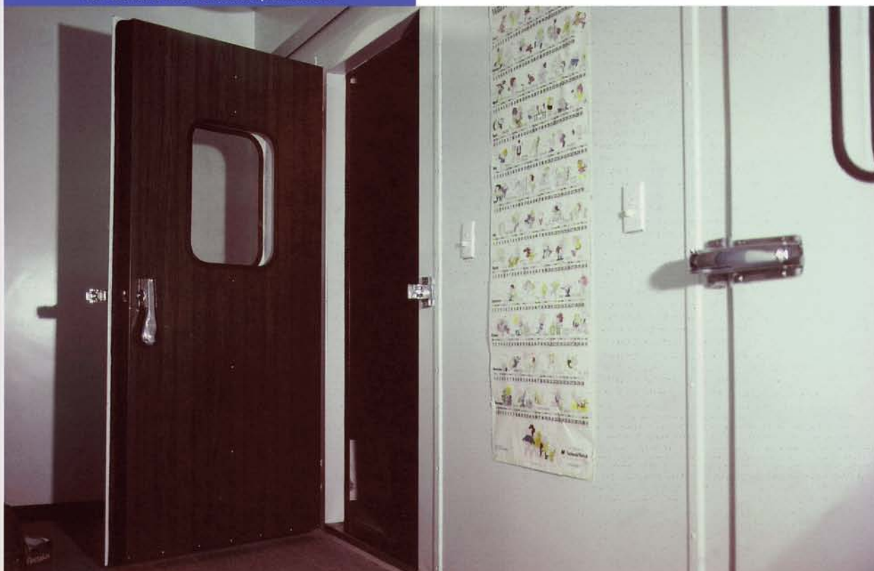
Non-Standard room to clients specifications.

The acoustic performance is detailed opposite and the purchaser should ensure that the space available will not cause any reduction in performance.