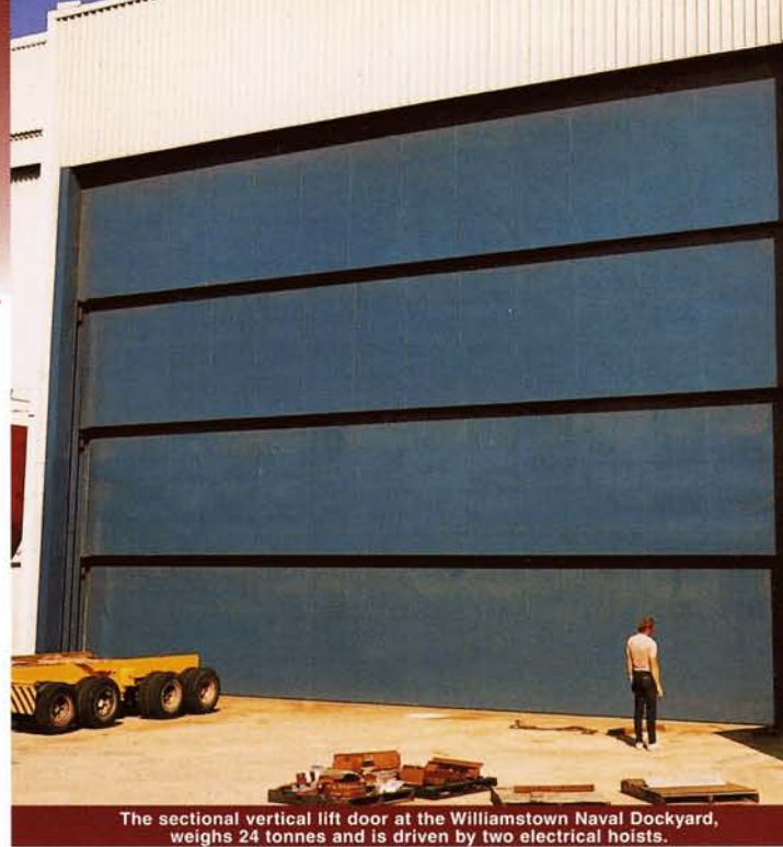
The sectional vertical lift door at the Williamstown Naval Dockyard, weighs 24 tonnes and is driven by two electrical hoists.

Selection of door type must be assessed early in the planning stage to ensure space is available to accommodate the track and head seals.