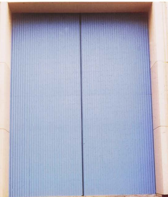
Sliding two leaf Dyna door at the City West Pumping Station at Hoppers Crossing.

Dyna Doors are specially constructed to suit any reasonable structural opening. Sizes and thicknesses are available to suit higher acoustic performance requirements. The door frame can be constructed from a wide range of head, jamb and sill sections. Large door sets which may require transportation in sections and special site installation or assembly conditions should be discussed with NAP Silentflo prior to design or purchase.