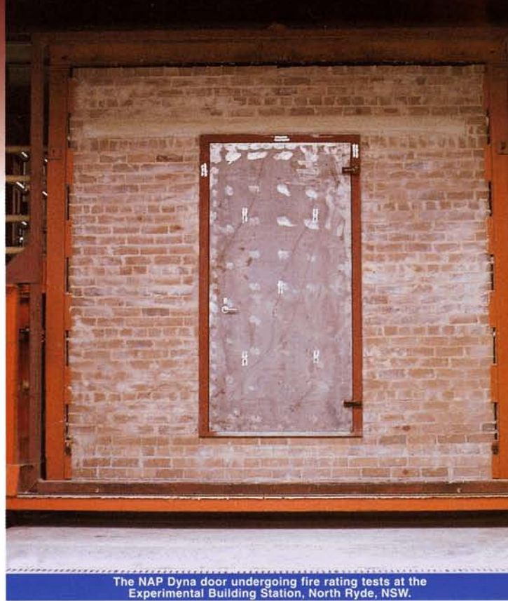
The NAP Dyna door undergoing fire rating tests at the Experimental Building Station, North Ryde, NSW.