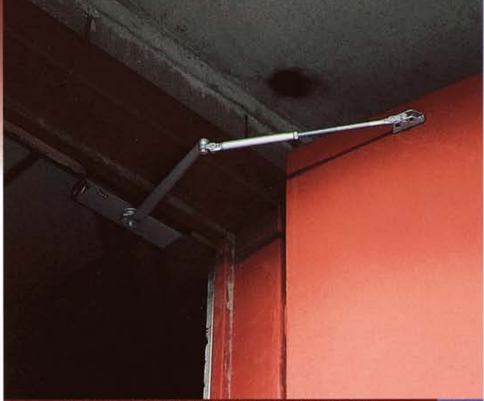
Dyna doors can be fitted with closers to either the front or reverse face of the door.

The sill, a feature of hinged Dyna Doors, is fabricated from 2.5mm thick stainless steel and it provides an attractive wear resistant finish. The perimeter acoustic edge seals built into the Dyna Door leaf maintain transmission loss and eliminate the need for adjustment for the life of the door. A soft snubbing gasket is provided to allow quiet closure into the jamb.