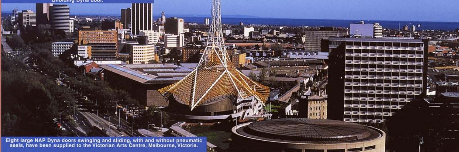
Eight large NAP Dyna doors swinging and sliding, with and without pneumatic seals, have been supplied to the Victorian Arts Centre, Melbourne, Victoria.