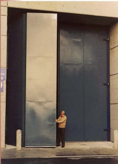
An example of a typical NAP Biparting and Bifolding Dyna door.

Equally large doors have also been supplied to the Tsim Sha Tsui Cultural Centre in Hong Kong.