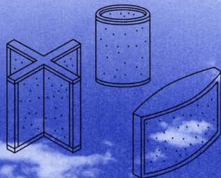
Typical Architectural Configurations Available