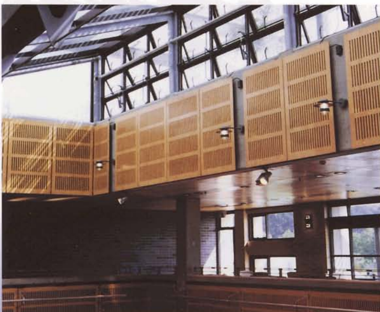
Photographs show NAP "Ambience" Panels as installed at Macquarie University in Sydney.

"The high tech solution to reverberation control"